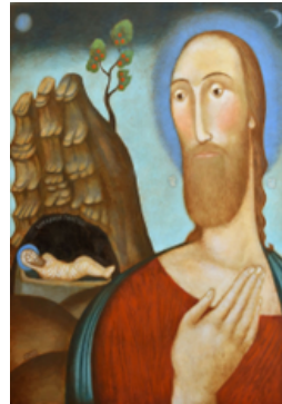
Text: Edwina Gateley, Growing into God (2000). Image: Julia Stankova, The Buried Lazarus (2012).

Contact the Parish Office for more information (02) 9628 7272.